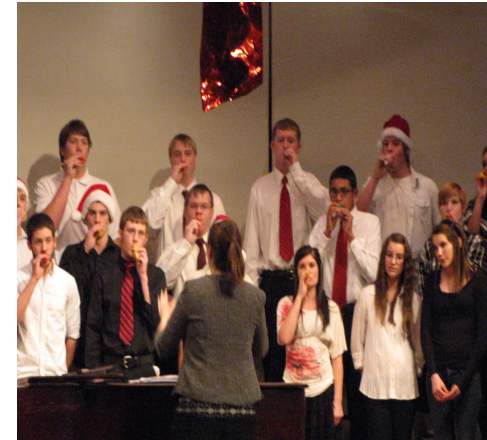
High School Band