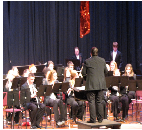
High School Band