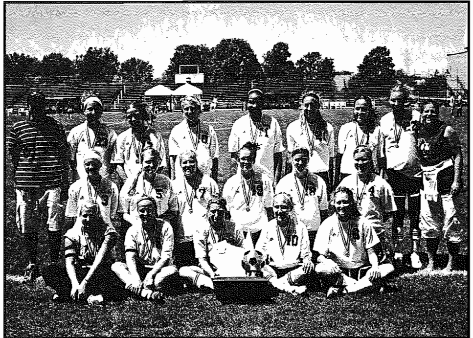
New Holstein High School 2010 Girls Soccer Team W.I.A.A. Division 3 State Champions

This was a very special group of girls who were focused on what they needed to do. They had excellent chemistry and worked well together. When they were on the field they always believed they could win, and when you believe in yourself and your teammates anything is possible.