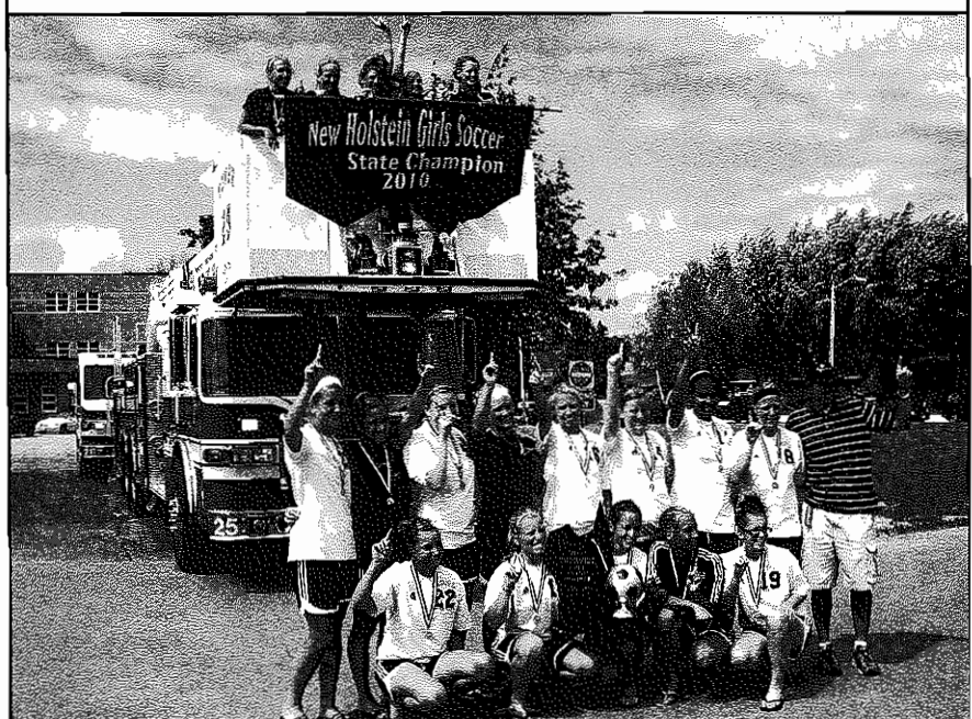
NHHS Girls Soccer team returns with their first Division 3 State Title